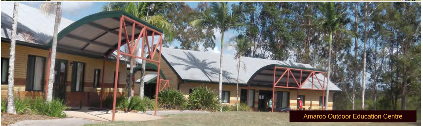
Amaroo Outdoor Education Centre