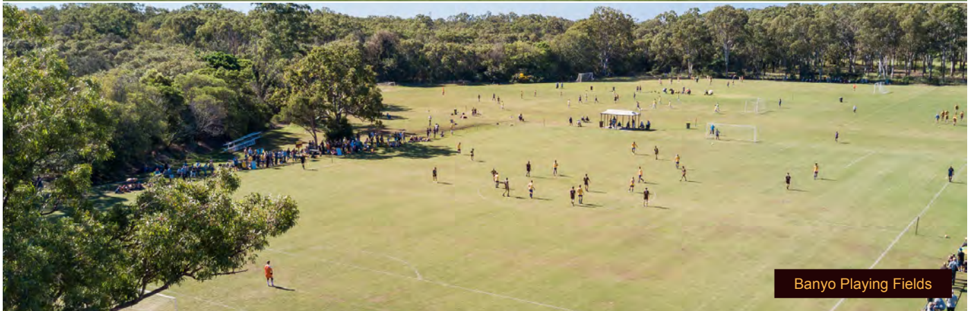
Banyo Playing Fields