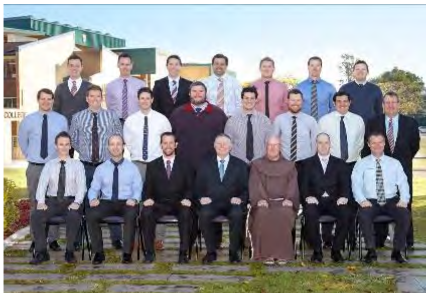
Old Boys on Staff