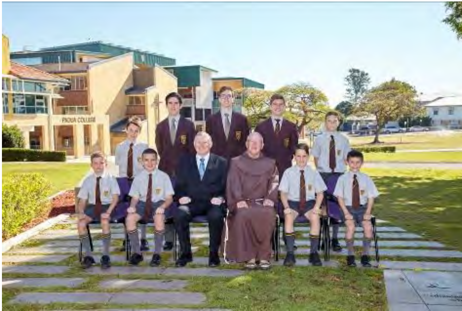
Grandsons of Old Boys 2015