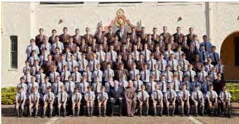
Sons of Old Boys