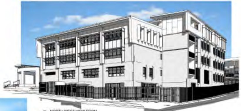
① NORTH WEST VIEW FROM JARDINE STREET