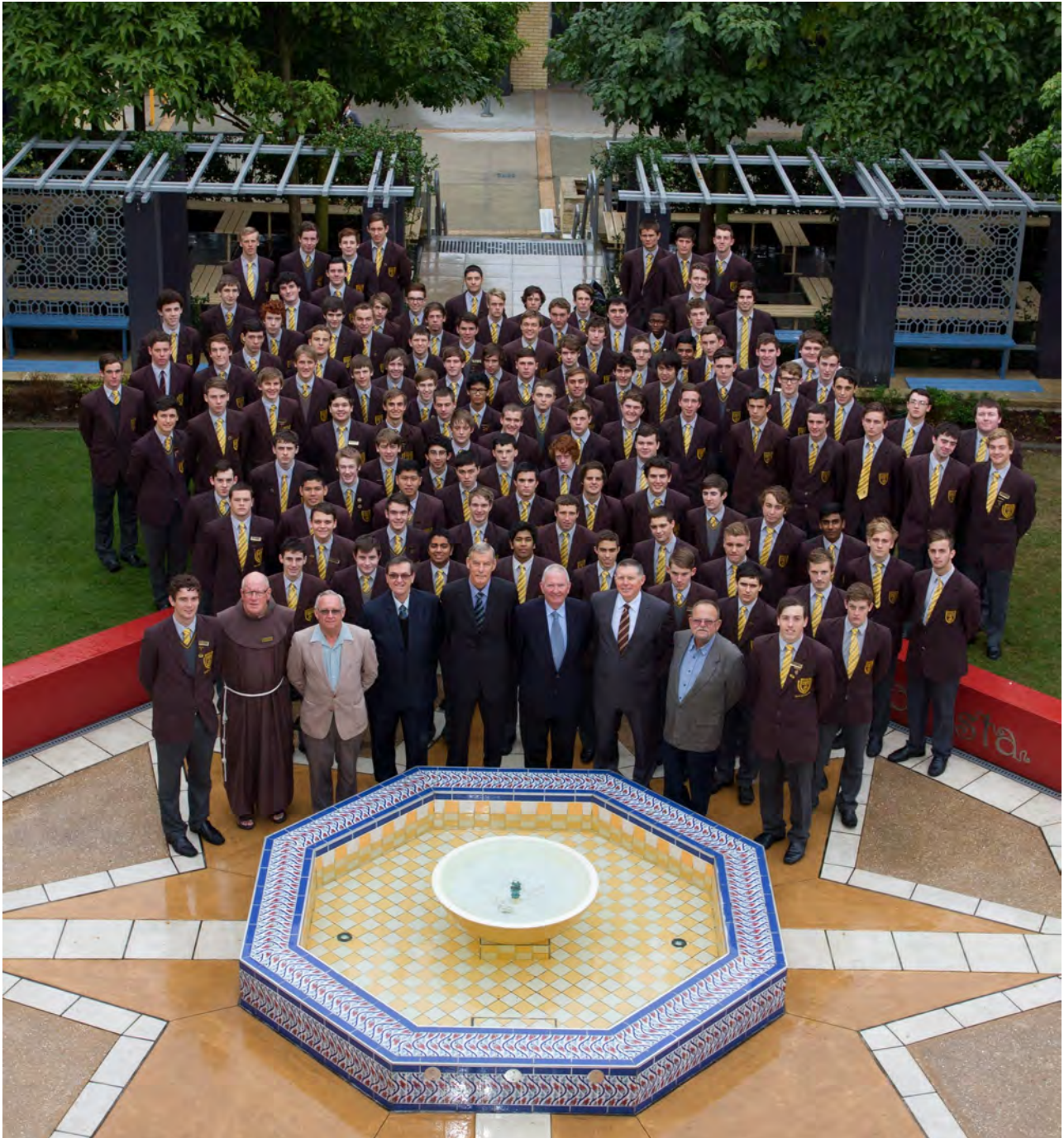
2013 Senior Class with Padua College Inaugural Graduates celebrating their 50th Reunion