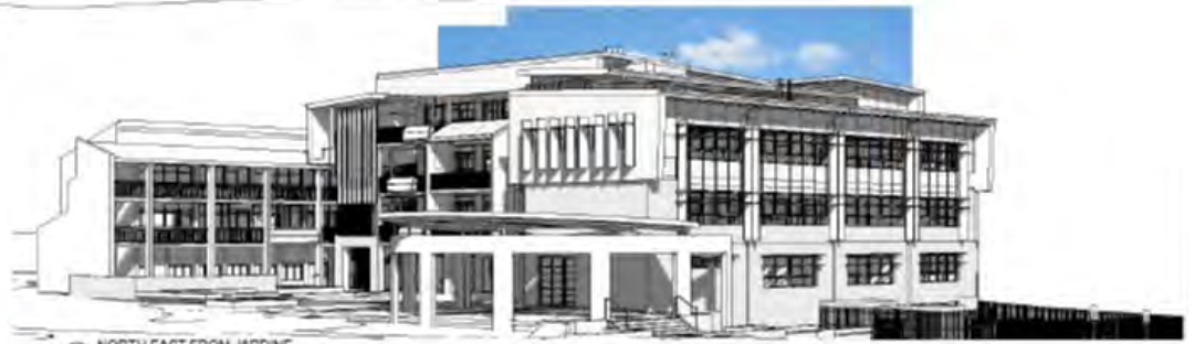
③ NORTH EAST FROM JARDINE STREET