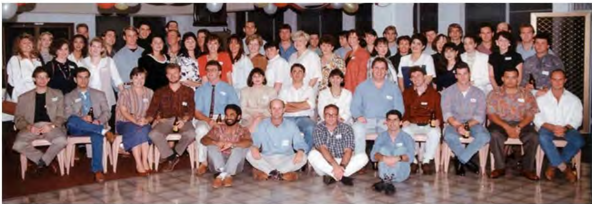
Taken at 10 Year Reunion