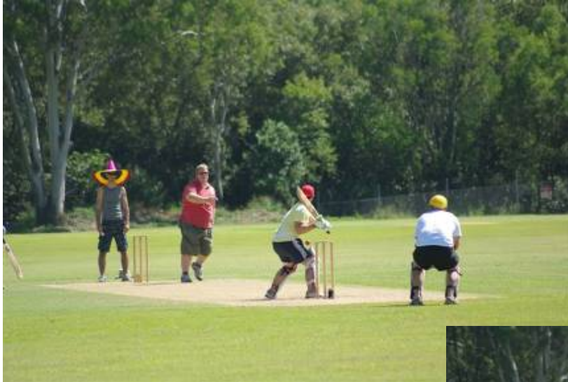
Photos from the Cricket Day