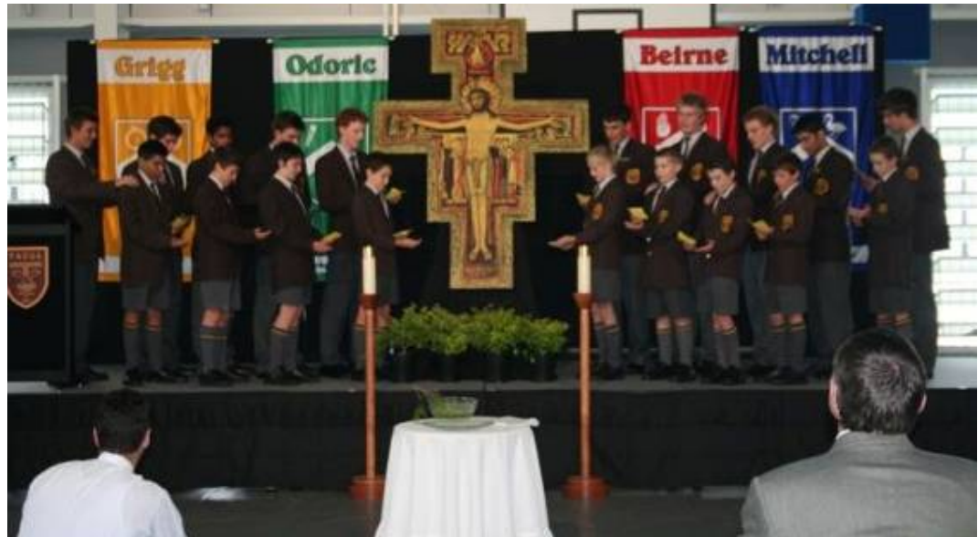
Commissioning of the 2009 College leaders in La Cordelle